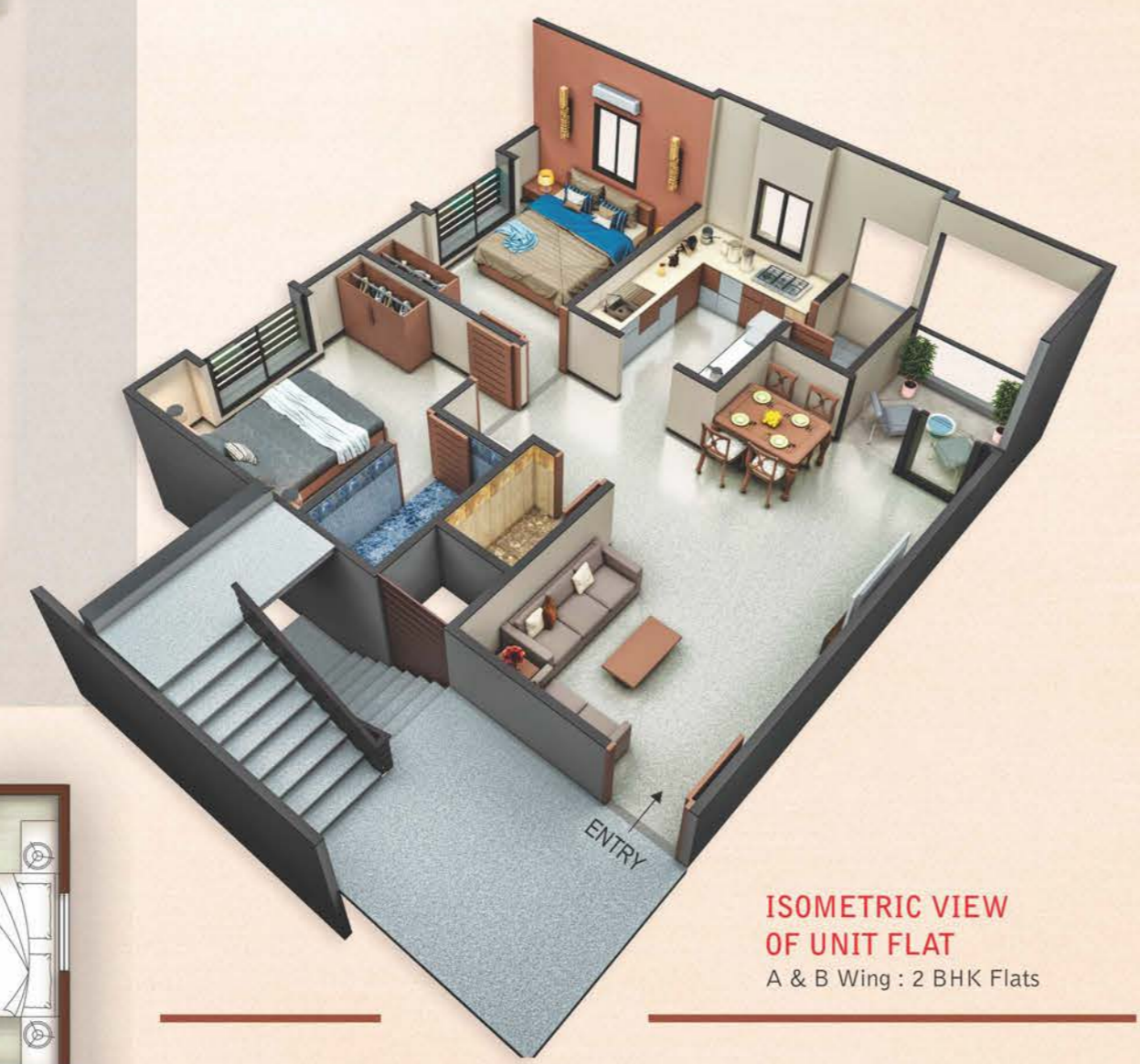
ISOMETRIC VIEW OF UNIT FLAT A & B Wing : 2 BHK Flats