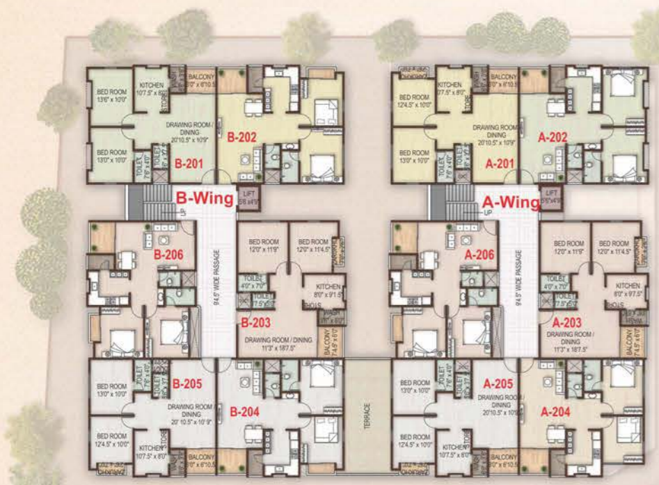
TYPICAL FLOOR PLAN Second Floor to Fourth Floor | 2 BHK Flats