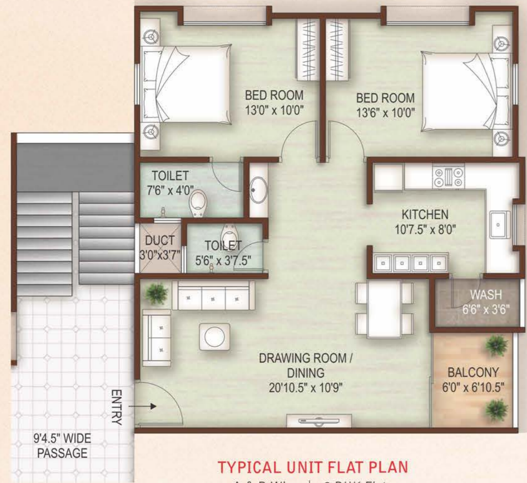
TYPICAL UNIT FLAT PLAN A & B Wing | 2 BHK Flats